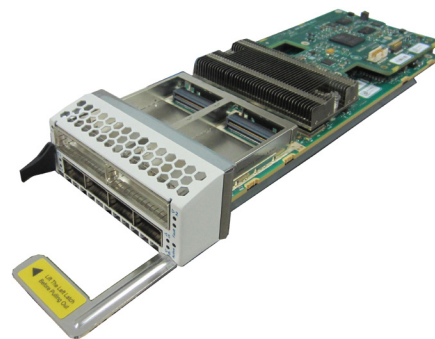
400G Coherent Module 1 (CHM1)