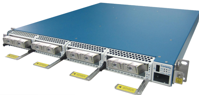
Coriant Groove™ G30 DCI Platform

The innovative three-tier modular concept of the Coriant Groove™ G30 DCI Platform provides a number of competitive advantages to DCI and telecom network planners and architects. The Coriant Groove™ G30 DCI Platform supports up to four field replaceable, individually configurable and hot-swappable 400G sleds (or field replaceable units). Each 400G sled can be equipped with up to two 200G line side interfaces (CFP2-ACO) and up to four 100G client side interfaces (QSFP28). Another 400G sled variant supporting a mix of 10G, 40G, and 100G clients is also available. The sleds and the pluggable interfaces can be purchased and deployed one at a time as required.